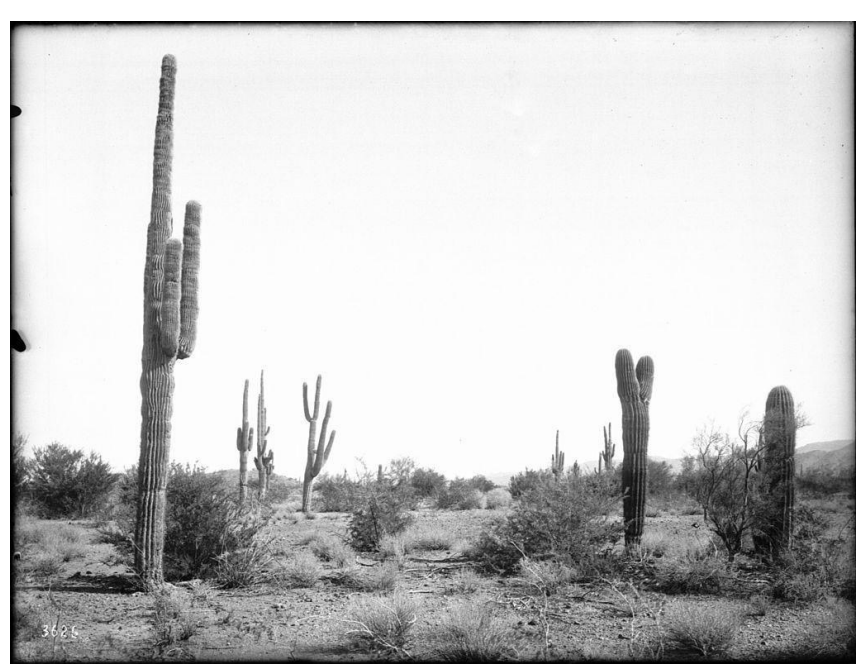
Giant saguaro cacti on the Pima Indian Reservation, Arizona, ca.1900

The giant saguaro (suh-WARR-oh) cactus can grow over sixty feet tall. It is found in the Sonoran Desert in Mexico and Arizona. Its branches are called arms and are covered with spines. When it rains in winter, the saguaro blooms. Birds build nests in saguaros. Bats eat saguaro flower nectar and fruit. You can see an army of saguaro cacti in Saguaro National Park. Saguaros grow very slowly, taking 150–200 years to reach full height. This giant cactus is a symbol of the American West.